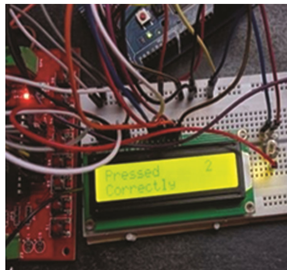
Fig. 3 — LCD display showing performance of exercise

activated. Visual feedback functions as when performing the exercise yellow LED glows, when once cycle is completed without break blue LED glows, when there is a wrong pressure in the middle of the cycle red LED glows. In LCD time taken to complete one cycle of the exercise is displayed. The number of right counts and number of wrong counts done are also displayed.