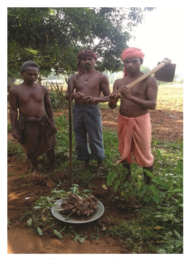
Fig. 4 — Harvested Colocasia