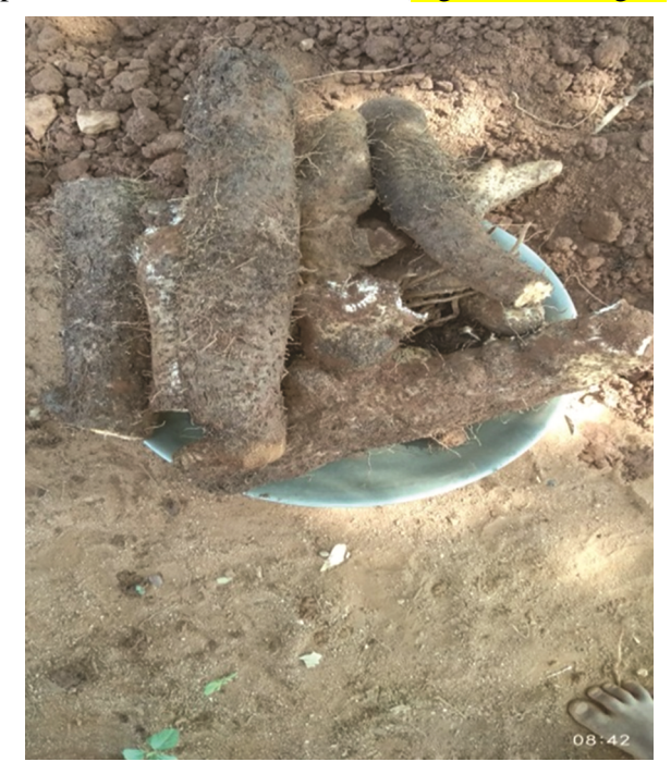
Fig. 3 — Harvested Cassava

and arrowroot. Out of these 7 species three species were found to be cultivated in the fields and other 5 species were available in wild (Fig. 3,4,5 & Fig. 6).