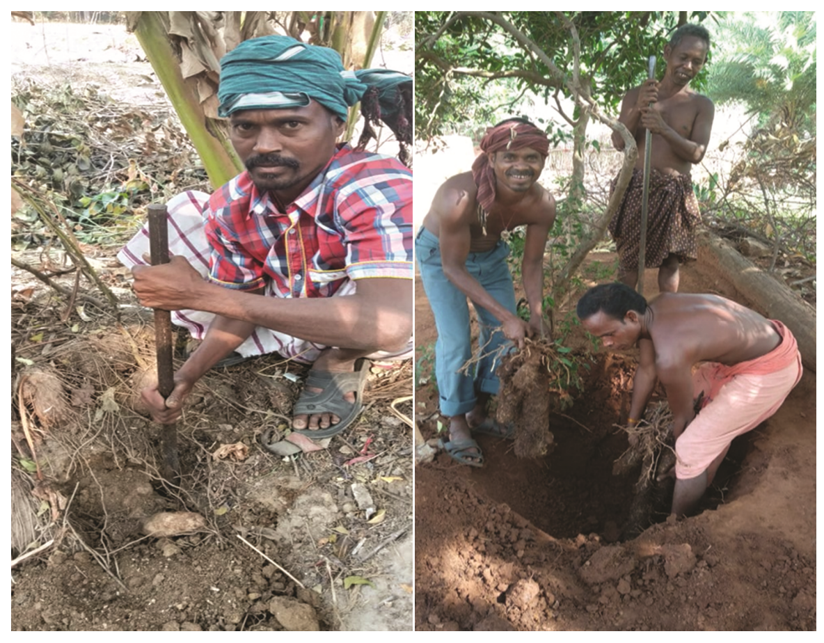
Fig. 5 & Fig. 6 — Digging out of Dioscorea spp. by the tribal people

The high dominance of wild species indicates that in many villages life is still traditional and local people remain dependent on nature. Regular harvesting from wild sources might be the cause for decrease in the production rate which was reported in South America and the production rate was decreased with 20.1, 1.2, 1.3% for tuber crops like cassava, sweet potato and yam respectively because of weather condition, disease and pest infestation<sup>37,38</sup>. Out of these species consumed by these tribes proportion of wild and cultivated species were also variable. This result establishes the truth that the tribal community depends on these tuber crops not only in the house hold nutrition but also as the supplementary food against paddy when the paddy production is low in variable climatic conditions. Maximum number of species was found to be consumed by the same tribe in different villages of these two blocks.