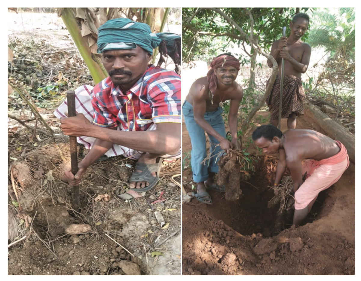
Fig. 5 — Digging out of Dioscorea spp. by the tribal people

production rate which was reported in South America and the production rate was decreased with 20.1, 1.2, 1.3% for tuber crops like cassava, sweet potato and yam respectively because of weather condition, disease and pest infestation<sup>37,38</sup>. Out of these species consumed by these tribes proportion of wild and cultivated species were also variable. This result establishes the truth that the tribal community depends on these tuber crops not only in the house hold nutrition but also as the supplementary food against paddy when the paddy production is low in variable climatic conditions. Maximum number of species was found to be consumed by the same tribe in different villages of these two blocks.