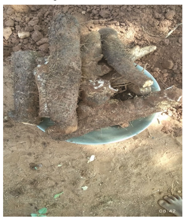
Fig. 3 — Harvested Cassava

many villages life is still traditional and local people remain dependent on nature. Regular harvesting from wild sources might be the cause for decrease in the