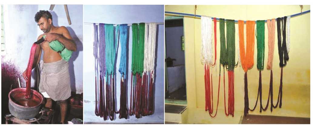
Fig. 3 — Dyeing of Kora silk