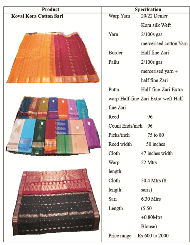
Fig. 1 — Specification of Kovai Kora cotton saree

The Kovai Kora Cotton sari is made from a mixture of cotton and kora silk yarn that is produced in pit looms using 2/100 gas mercerized extra-long staple for the weft and Jari for the pallu and putta (Fig. 1). The sari has got a wide market in Kongu region<sup>9</sup>.