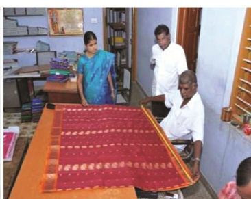
Fig. 8 — Quality checking