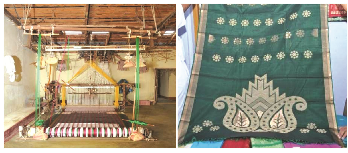
Fig. 7 — Pallu design