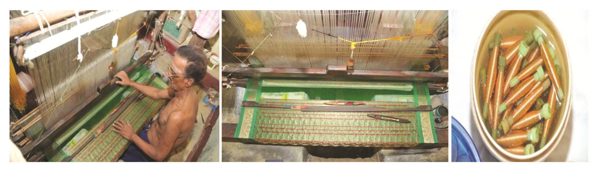
Fig. 6 — Pit loom