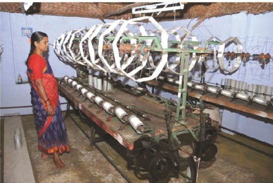
Fig. 4 — Warping of Kora silk