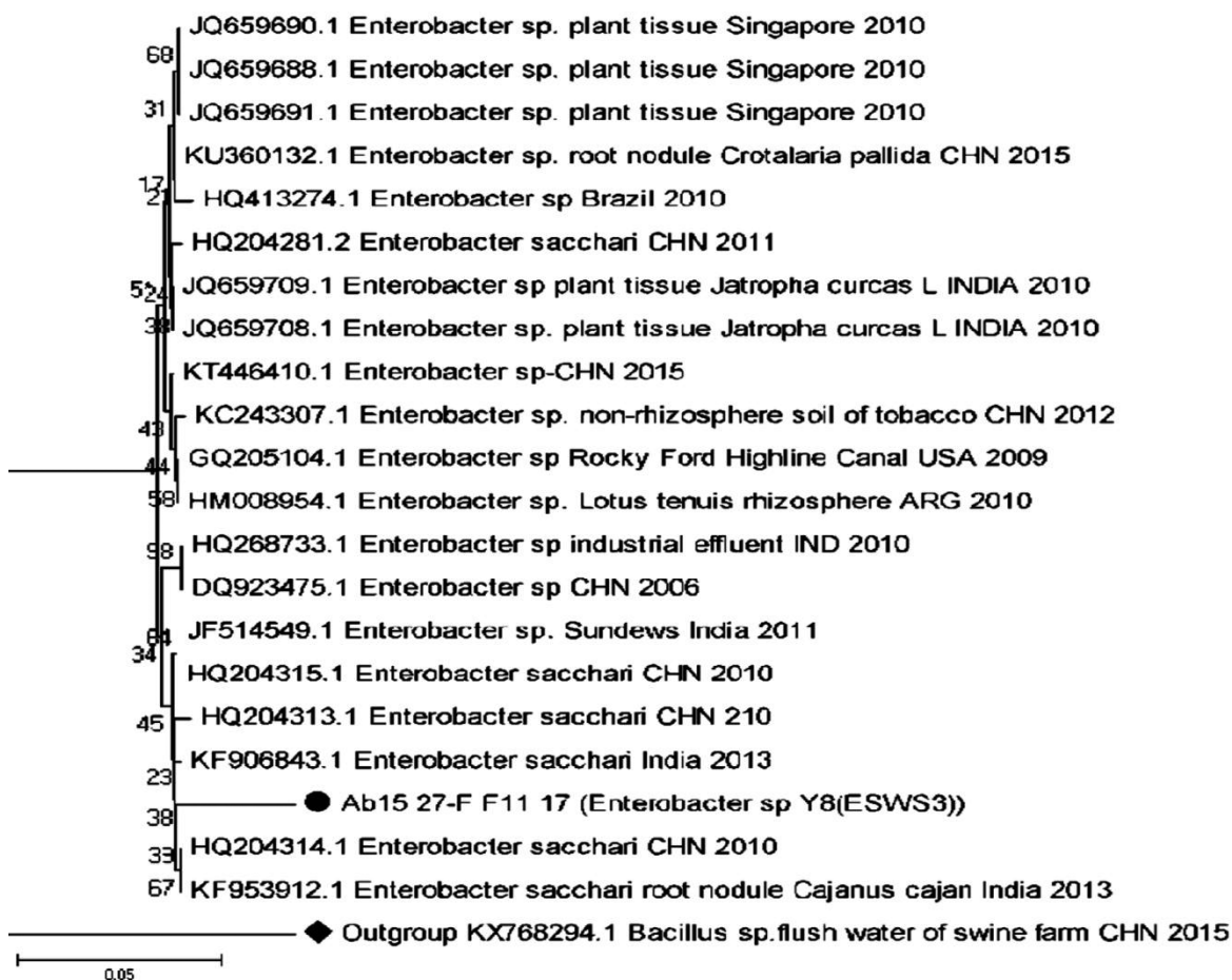
Fig. 1 — Neighbor – joining Phylogenetic tree showing the relationships among Enterobacter sp.

Y_8 (Table 1) was among the best bacteria isolates that exhibited higher optical density reading of 1.42 and strong visual turbidity (+++) on the crude oil minimal medium indicating a strong crude oil utilization potential. Others encountered in the ecosystem demonstrated weak or fairly strong oil degrading capabilities. The phylogenetic tree for Enterobacter sp. as shown in Fig. 1 is distinct from other Enterobacter sp. from the Gen Bank especially those from Asian origin Enterobacter sp.